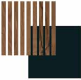
CASTLE OAK BLACK