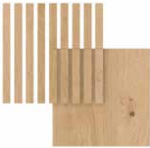
PEPPER OAK PEPPER OAK