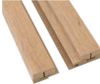
END PROFILES KIT 20 x 77 x 2770 mm