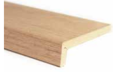
COVER PROFILE 30 x 120 x 2700 mm