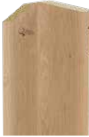
CORNER PROFILE 2 x 50 x 2700 mm